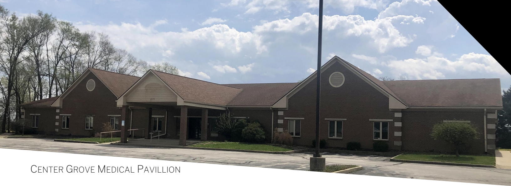
CENTER GROVE MEDICAL PAVILLION